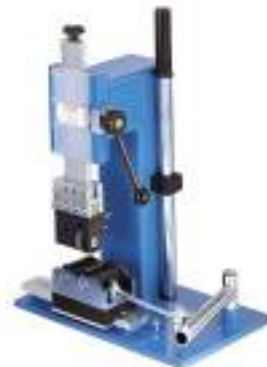
Ferrule Marking Machine