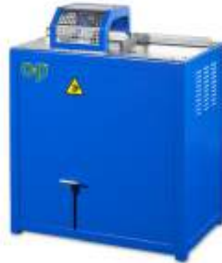
OP Hose Cutting Machine