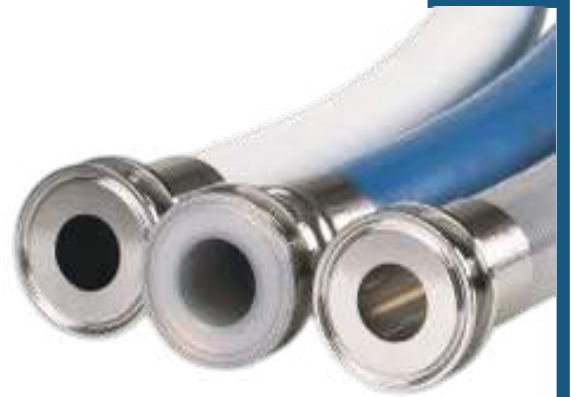
Teflon (PTFE) Hose Assemblies