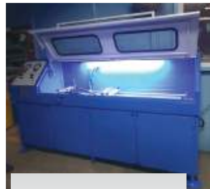
Testing Pump (Upto 700 bar)