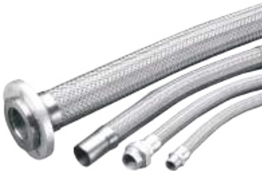
Stainless Steel Flexible Hose Assemblies