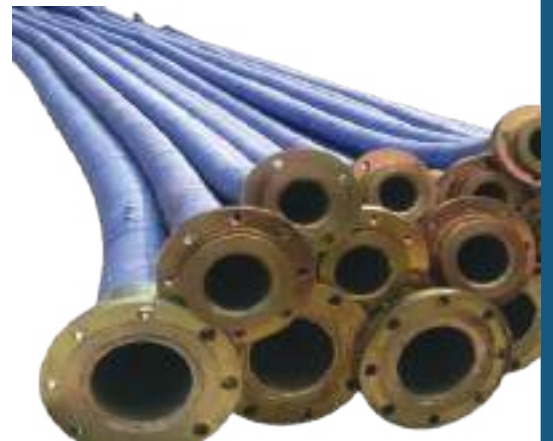
Cement, Slurry, Discharge and Suction Hoses upto 6"