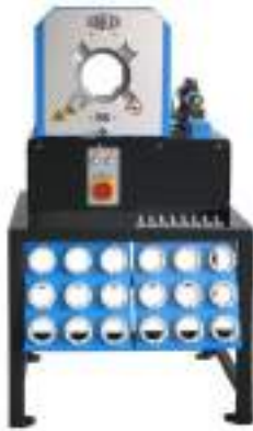
Uniflex Non Grease Crimping Machine