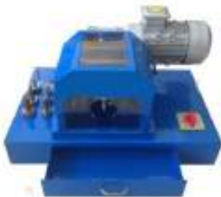
Hose Skiving Machine