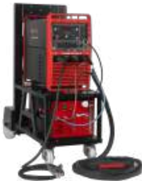
TIG Welding Machine